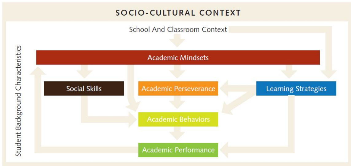
Figure 1.1. Noncognitive Factors Framework