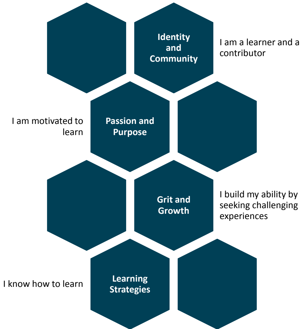
Figure 1.3. Key Components of Student Academic Mindsets